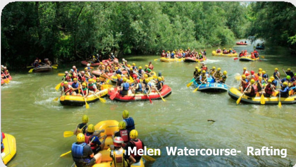
Melen Watercourse- Rafting

Sakarya province hosts numerous activities intertwined with nature. In the city, activity areas such as ski centers, paragliding, and rafting are located 20 minutes away from the campus. Bicycle use is widespread with urban cycling routes. Transportation is also provided by minibusses and buses.