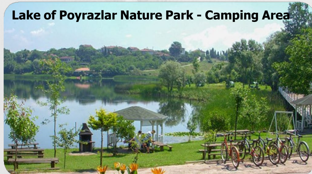
Lake of Poyrazlar Nature Park - Camping Area

Sakarya, one of the greenest provinces in Turkey, is famous for its camping and picnic areas. In addition, there is a public beach in the district of Karasu, which has a coast to the Black Sea.