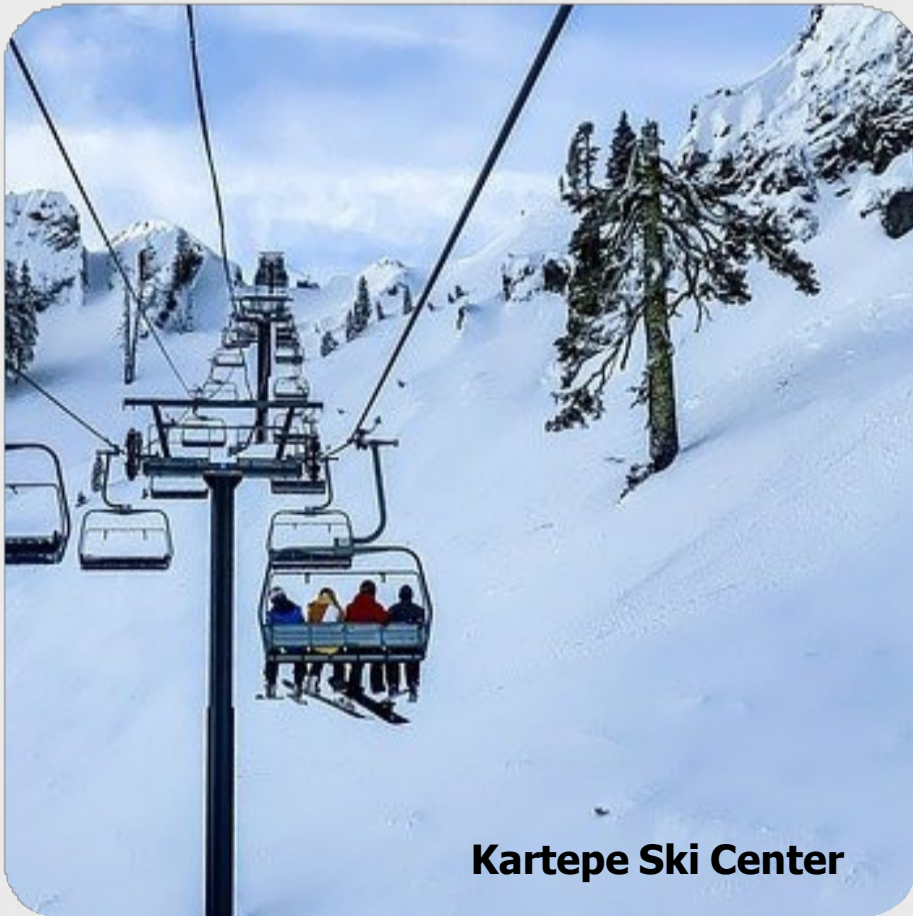
Kartepe Ski Center